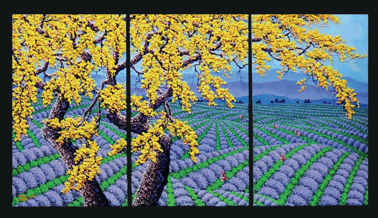
LAVENDER & YELLOW TREE acrylic on canvas, 100 x 200 cm