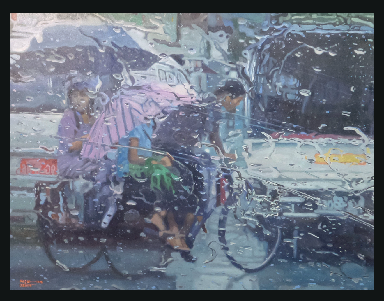
IN THE RAIN (1) acrylic on canvas, 92 x 122 cm