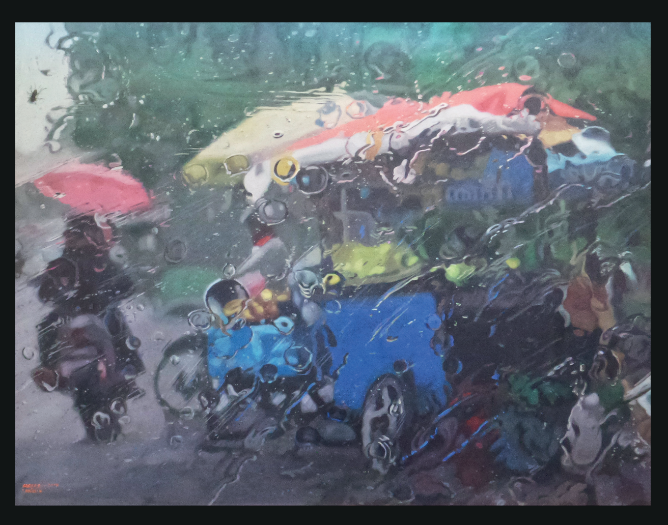
IN THE RAIN (2) acrylic on canvas, 92 x 122 cm