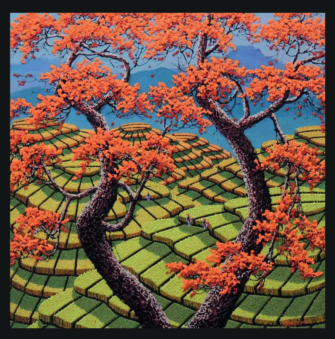
GOLDEN STEP AND RUBY FLOWER acrylic on canvas, 122x 122 cm