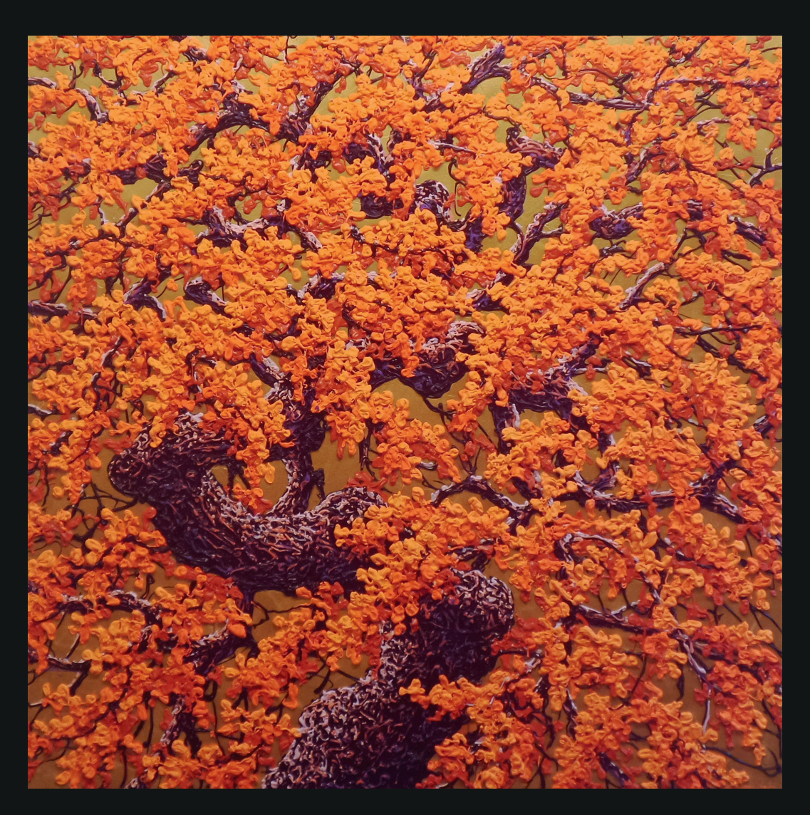
RED RUBY FLOWER acrylic on canvas, 122 x 122 cm