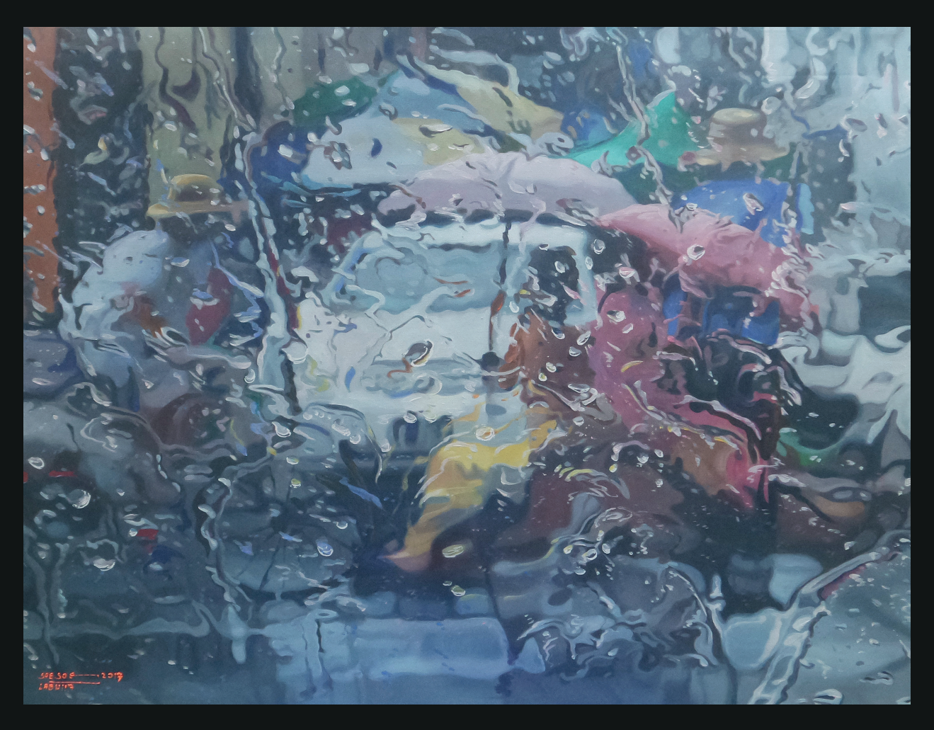
IN THE RAIN (3) acrylic on canvas, 92 x 122 cm