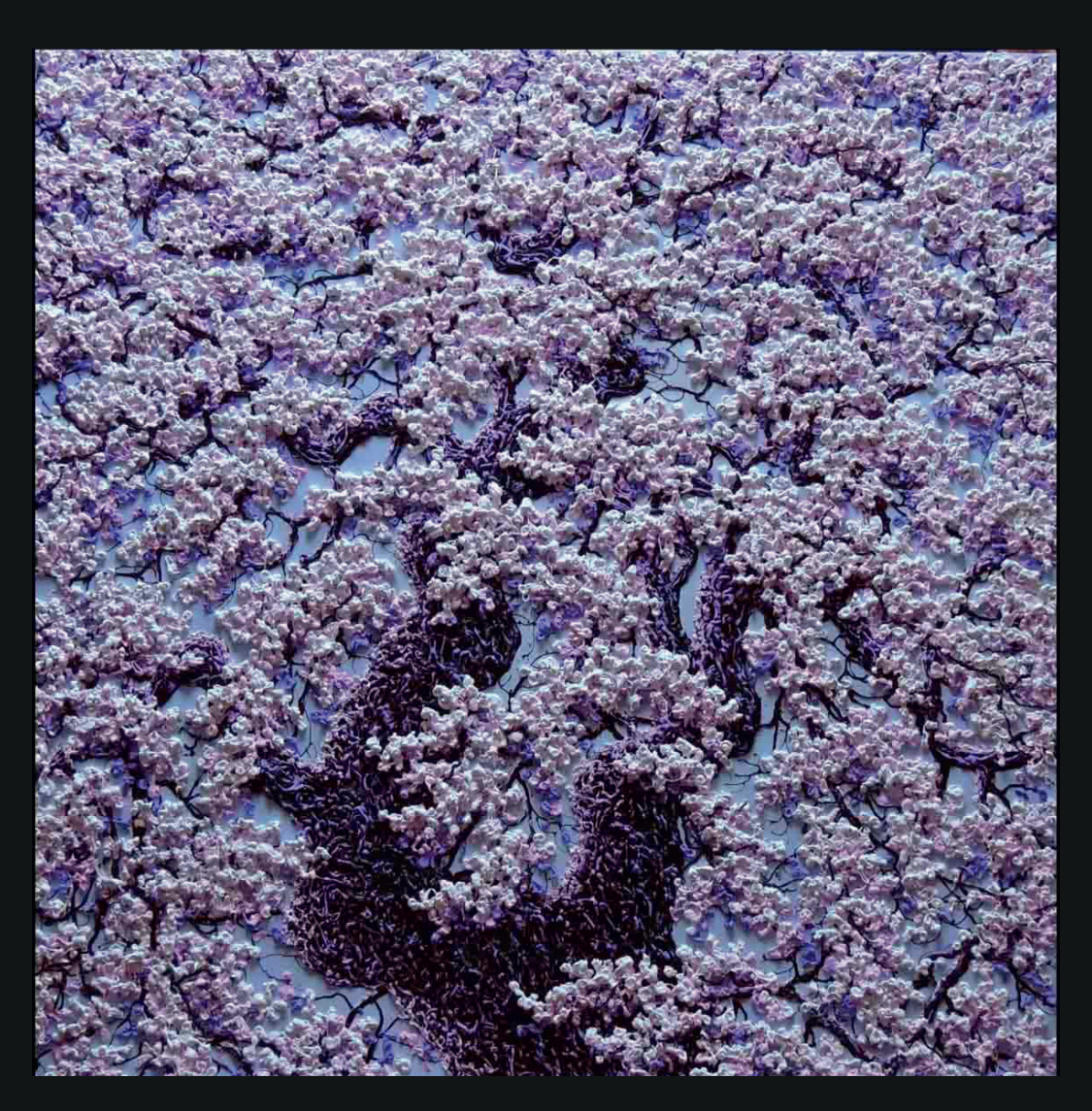
CHERRY BLOSSOM acrylic on canvas, 140 x 140 cm