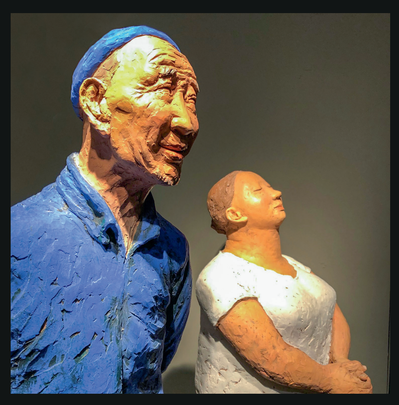
N^{\circ} 2 terra cotta, acrylic and pigment, 104x23x23 cm (left)

N° 1 terra cotta, and acrylic, 93 x 37 x 23 cm (right)