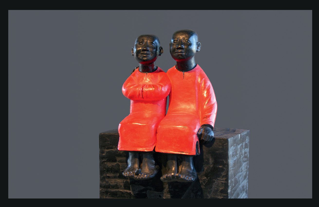
N° 8 À L'ÉCOUTE terra cotta and pigment red / black, 46 x 28,5 x 27 cm