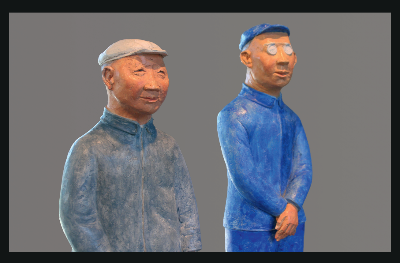
N^{\circ}5 terra cotta and pigment, 48 \times 19 \times 10 \text{ cm} (left)

N° 6 terra cotta and pigment, 53,5 x 14 x 11 cm (right)