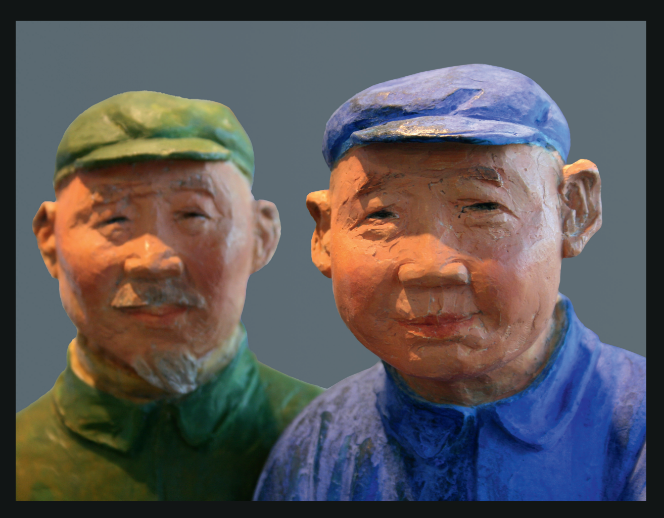
N° 7 terra cotta and pigment, 49 x 28 x 11 cm