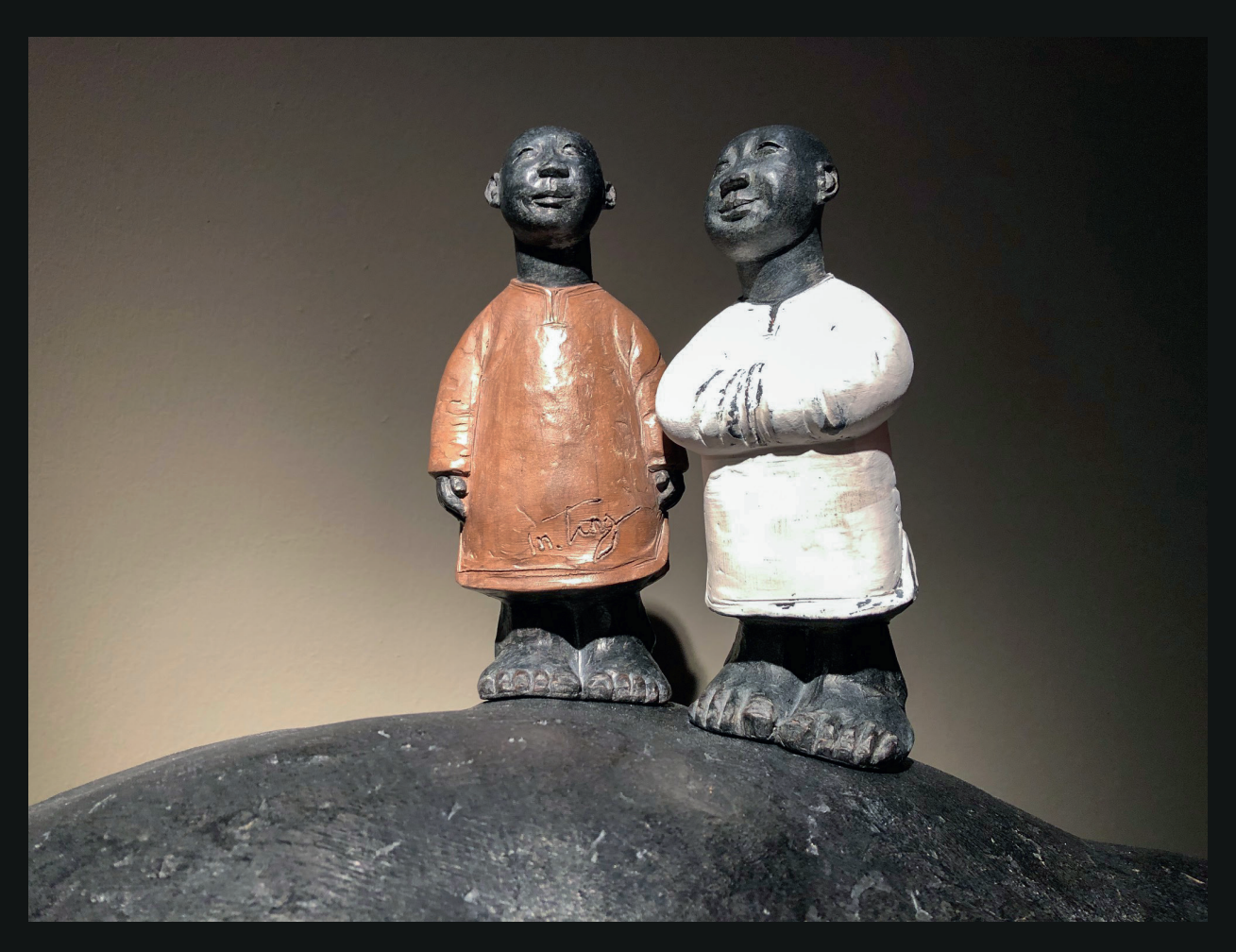
N° 4 terra cotta and pigment, 63 x 52 x 27 cm